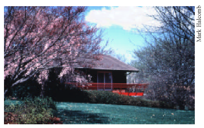
A variety of landscape materials in an attractive residential setting.

eastern tent caterpillar, various aphids, mites, scale and borers. Consult with your local garden center, nursery, tree care professional, county Extension office or forester to discuss if a tree being selected is prone or sensitive to local diseases or insects.