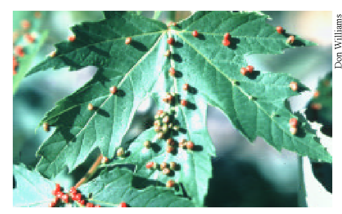
Insect galls (maple bladder gall mite) on silver maple leaves.

Maintenance. Tree maintenance is an unavoidable task that homeowners should include in their evaluation of a tree. Most fast-growing trees will require more frequent maintenance than species with moderate to slow growth. The