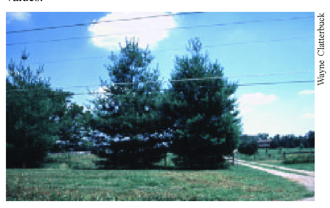
Eastern White Pine interfering with overhead utility lines.

Trees provide many benefits for the home landscape. Shade, color, vertical dimension, soundproofing, cooling, beauty, screening, windbreaks, boundary lines and wildlife habitat are just a few. Tree use is varied: framing the view of a house or landscape, screening out eyesores, dividing the landscape area, creating privacy and conserving energy. Landscape trees can be shade trees, flowering trees, framing trees, border trees, street trees, patio trees, fruit or nut trees and wildlife trees. Trees may also enhance property values.