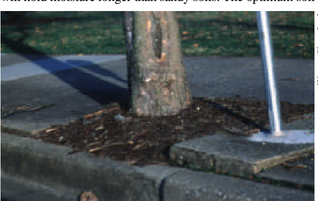
Sidewalk uplifted by tree roots.

The physical aspects of the soil include its volume and texture (amount of sand, silt and clay). These soil properties influence aeration, internal drainage and water-holding capacity. Soils with large pore spaces (sand) will drain faster than those with small pore spaces (clay). However, clay soils will hold moisture longer than sandy soils. The optimum soil